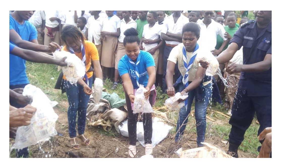
Photo 10 If you don't like something, change it! In Nyagatare, Girl Guides burning Kanyanga with the Police.