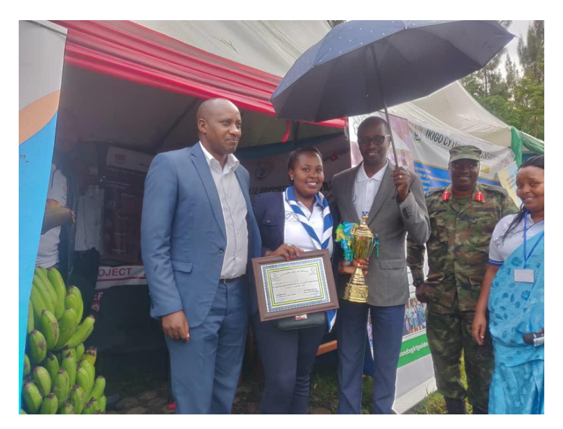
Photo 15 AGR was nominated among the 2019 Best Partners of the Western Province during the annual partners' exhibition, attended by the Governor and other officials