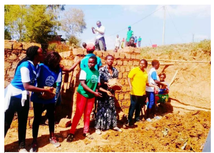
Photo 22 With their own means, Burera Girl Guides rehabilitated two houses for vulnerable families