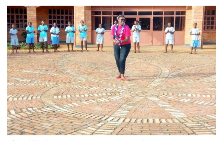
Photo 238 The new District Commissioner of Bugesera meeting some of her girls