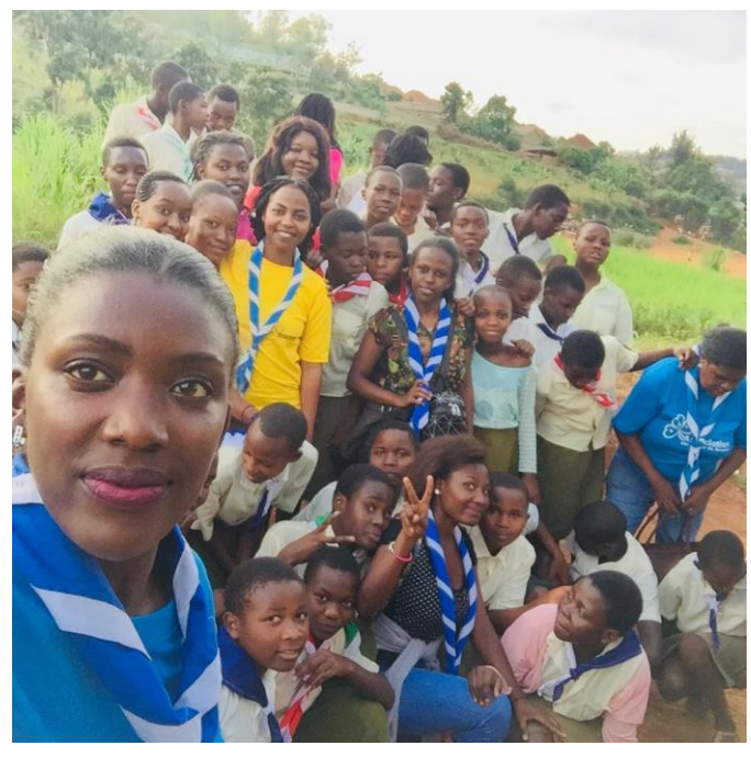
Photo 12 "Girl Guides of Kicukiro after supplying stationaries, sanitary products and money girls in need of Gatenga