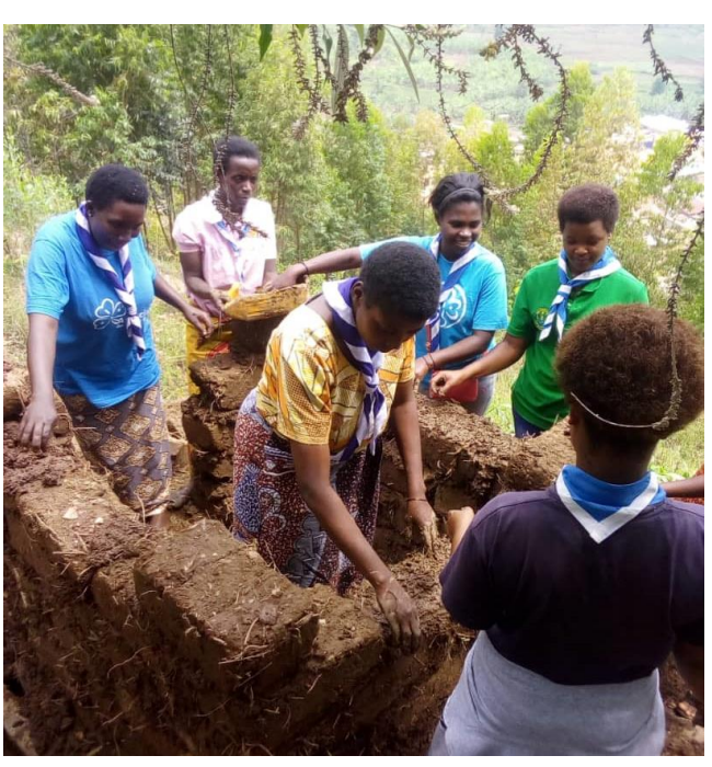
Photo 11 Nyagatare Girl Guides constructing toilets to families during the Guiding week in February 2019.