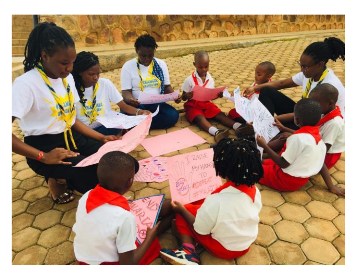
Photo 14Photo 14 YESS Girls 2019 educating Bergeronnettes how to prevent Malaria