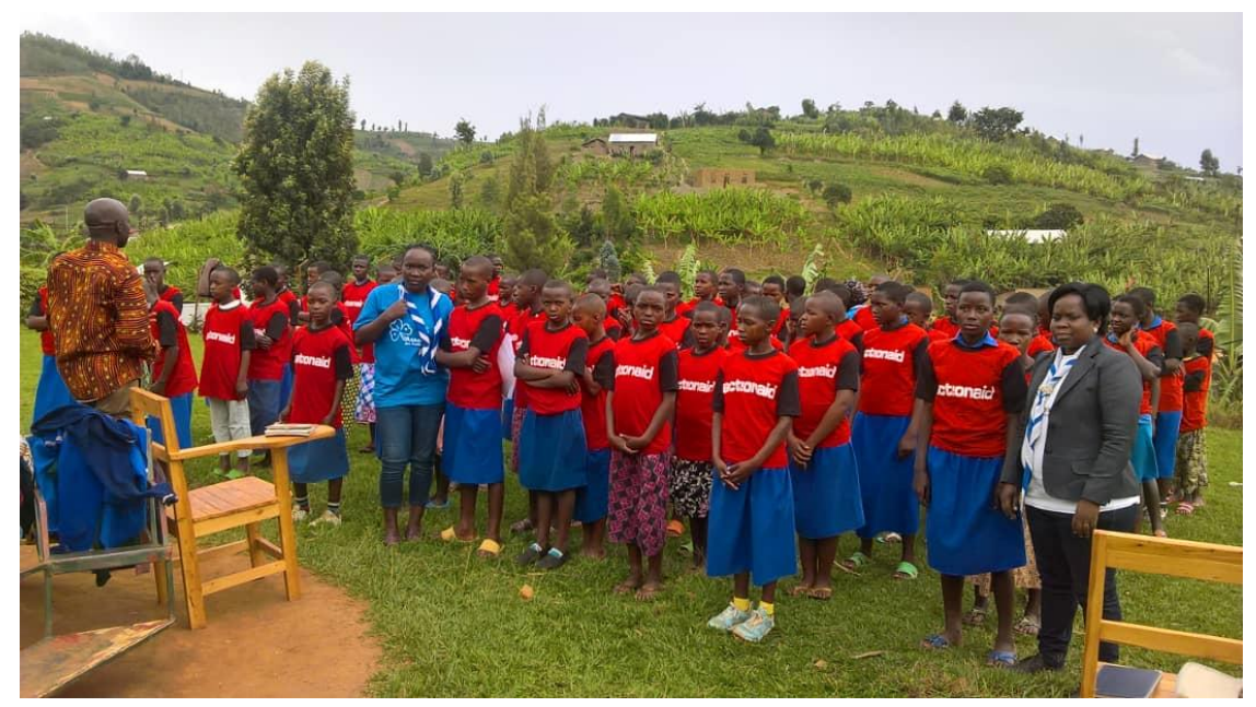
Photo 5Girl Guides of Karongi District with ActionAid Rwanda delivered SRHR sessions to 100 girls in the camp