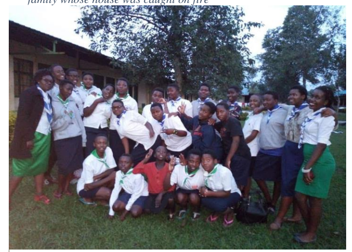
Photo 21 After a fun day, Rubavu Youth Committee with their District Commissioner