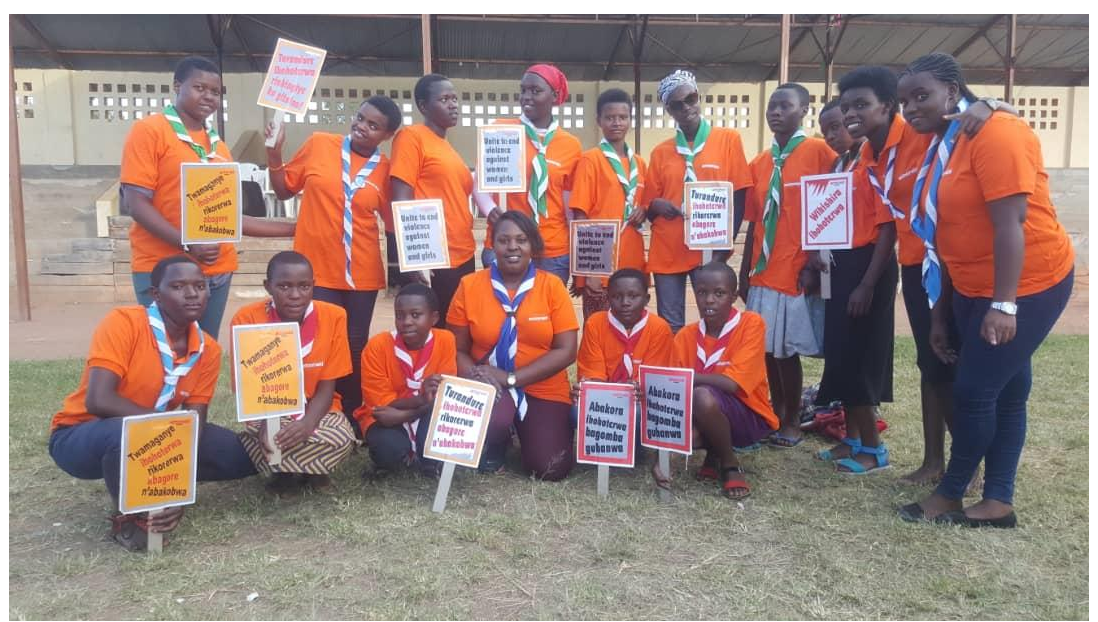
Photo 2 Nyanza Girl Guides after the walk against violence during the 16 Days of Activism against Violence