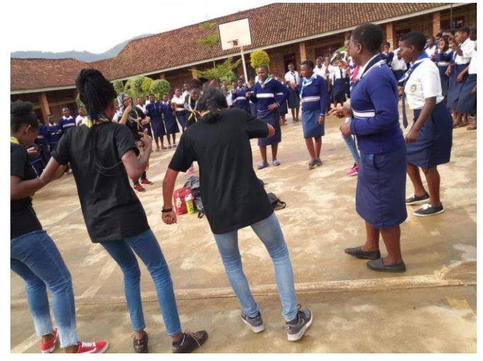
Photo 24 If it's not fun, it's not Guiding. Gakenke Girl Guides in their weekly meeting