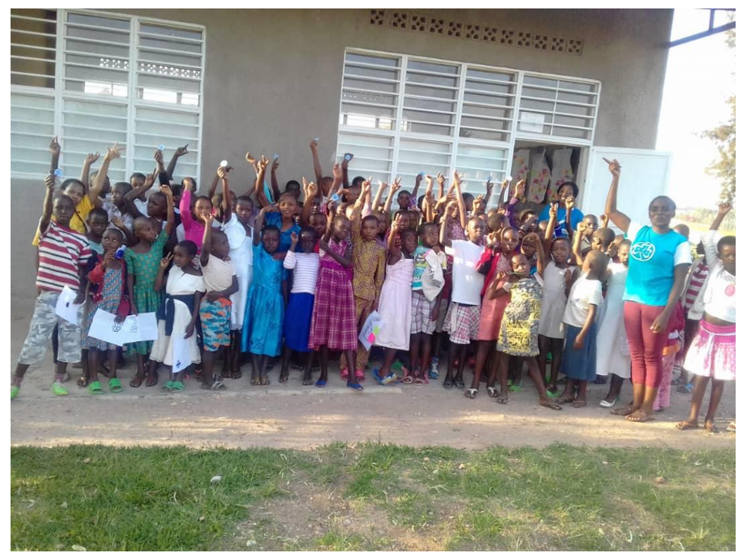
Photo 7 Boys and girls are waving their badges after completing their Free Being Me sessions