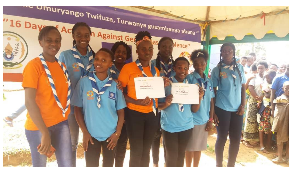
Photo\ 4\ Girl\ Guides\ in\ \ Huye\ District\ joined\ AGR\ stakeholders\ during\ the\ launching\ of\ the\ 16\ Days\ of\ Activism\ 2018