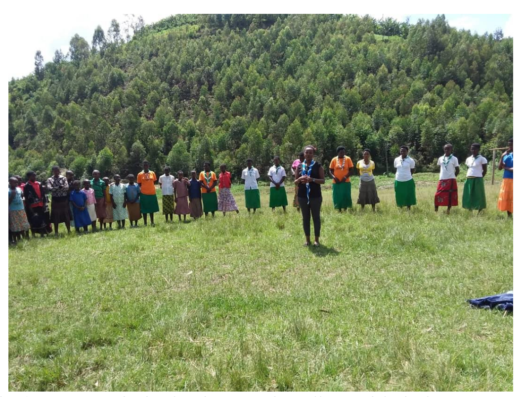
Photo 1 Bergeronnettes and Cadres of Gatsibo District in their weekly meeting before breaking out into activities