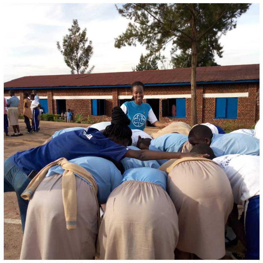
Photo 9 Nyarugenge Girl Guides have been busy energizing existing troops while reinforcing their leadership skills