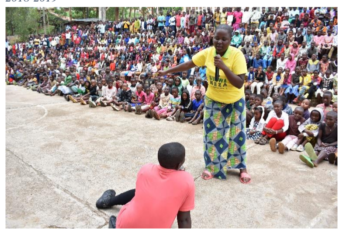
Photo 27 Muhanga Girl Guides performing at the International Day of the Girl 2018